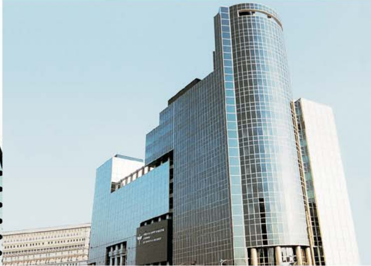
AMF Project Chamber of Commerce and Industry, Romania