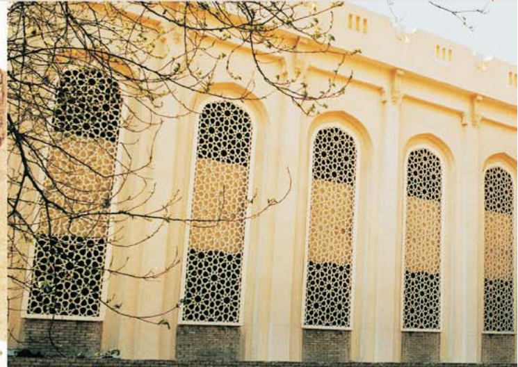
AMF Project University of Cairo Egypt