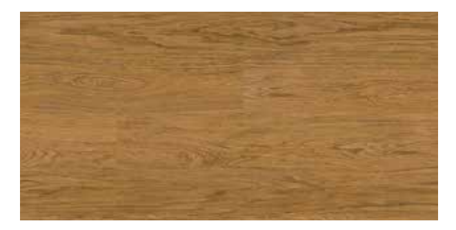
Nature Oak | B5T5001 4