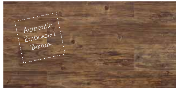
Century Fawn Pine | B5P7001 4