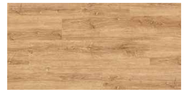
Chalk Oak | B5Q1001 4