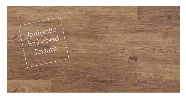
Castle Toast Oak | B5P1001 4