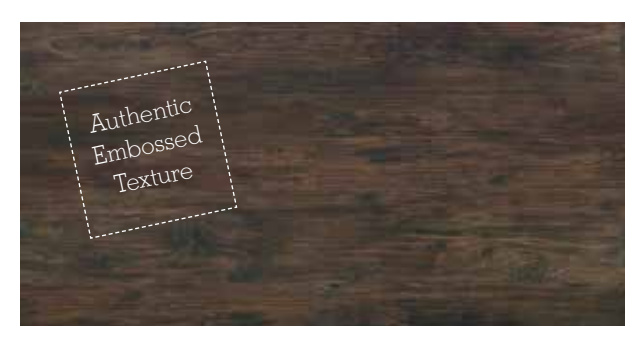
Century Morocco Pine | B5P6001 4