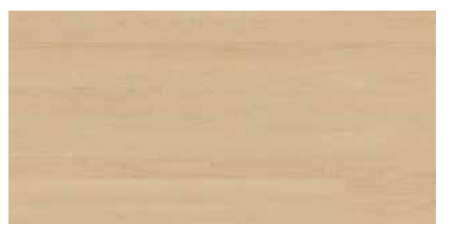
Light Beech | B5T0001 4 🗠

* Please see the terms and conditions of Wicanders Limited Warranty in the website.