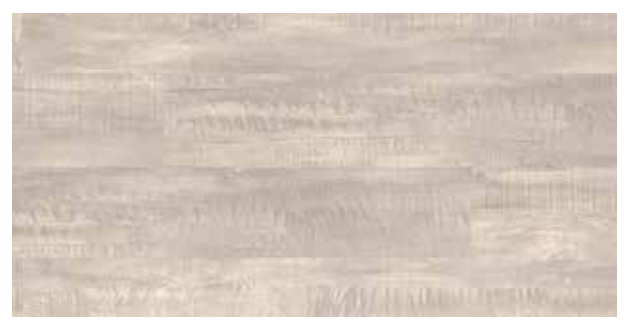
Claw Silver Oak | B5V3001 4