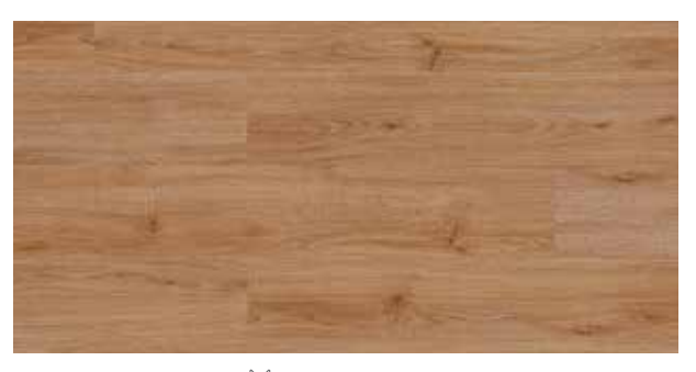
European Oak | B5Q2001 4