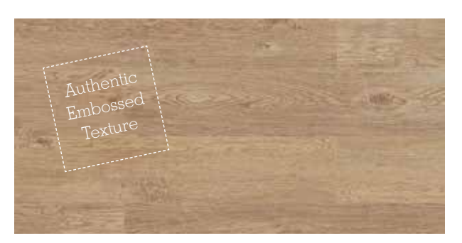
Castle Raffia Oak | B5P0001 4