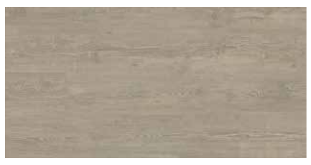
Wheat Pine | B5R3001 4