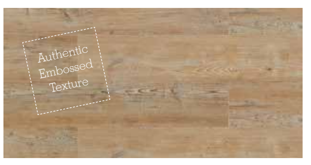
Arcadian Soya Pine | B5P4001 4 🗠