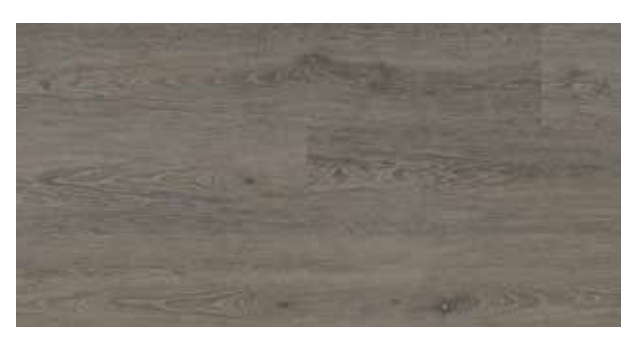
Cinder Oak | B5R7001 4