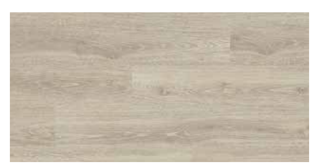
Limed Grey Oak | B5T7001 4 🖄