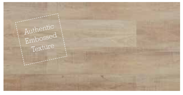
Sawn Bisque Oak | B5P3001 4