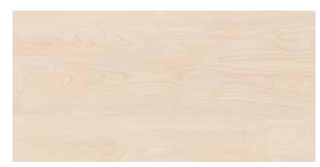
Linen Cherry | B5R0001 4

* Please see the terms and conditions of Wicanders Limited Warranty in the website.