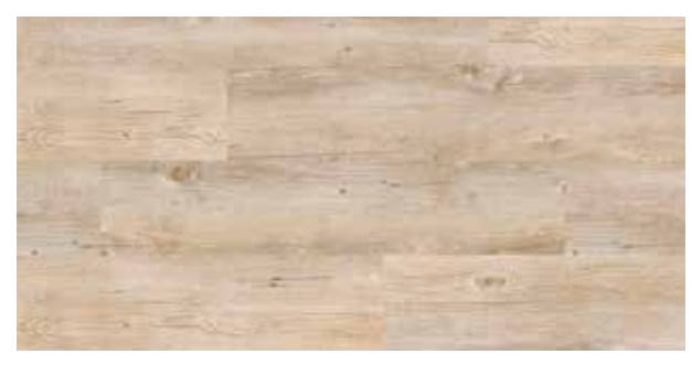
Alaska Oak | B5Q0001 4