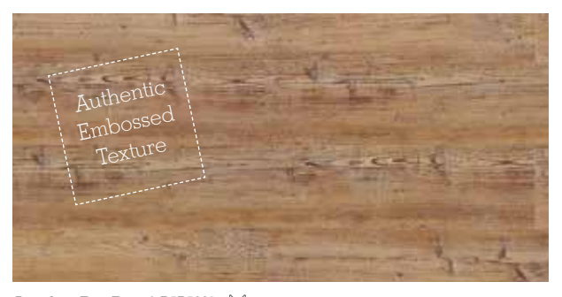
Arcadian Rye Pine | B5P5001 4 🗠