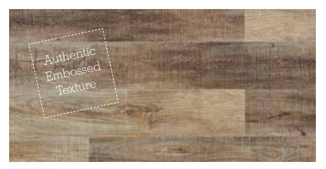
Sawn Twine Oak | B5P2001 4 🖄