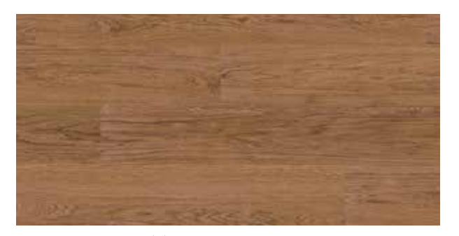
Elegant Oak | B5R4001 4